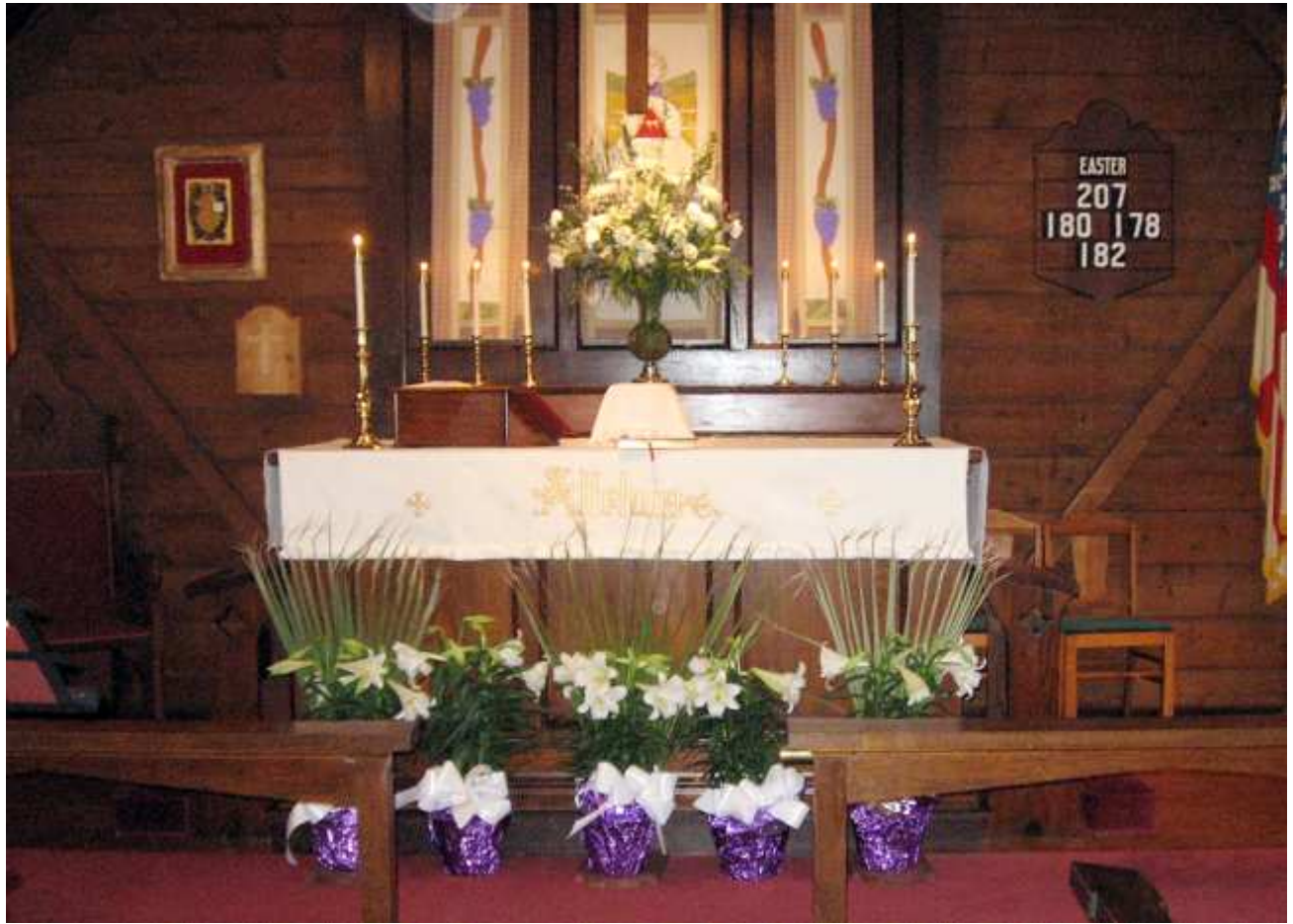
Trinity Chapel Altar, Easter Sunday 2008